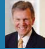
FORMER SENATE MAJORITY LEADER AND BPC CO-FOUNDER TOM DASCHLE