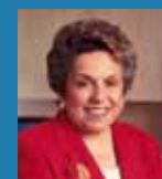
FORMER HEALTH AND HUMAN SERVICES SECRETARY DONNA E. SHALALA