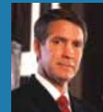
FORMER SENATE MAJORITY LEADER AND BPC SENIOR FELLOW BILL FRIST