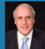
FORMER SECRETARY OF AGRICULTURE, FORMER REPRESENTATIVE AND BPC SENIOR FELLOW DAN GLICKMAN