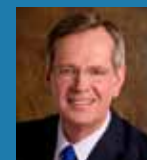
FORMER GOVERNOR OF UTAH AND FORMER HEALTH AND HUMAN SERVICES SECRETARY MIKE LEAVITT