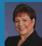
FORMER EXECUTIVE DIRECTOR OF UNICEF AND FORMER SECRETARY OF AGRICULTURE ANN M. VENEMAN