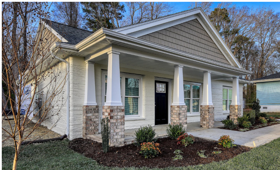
A 3D printer pours concrete to ultimately create Habitat for Humanity's first owner-occupied, 3D-printed home—a 1,200 sq. ft house constructed in only 28 hours in Williamsburg, VA.