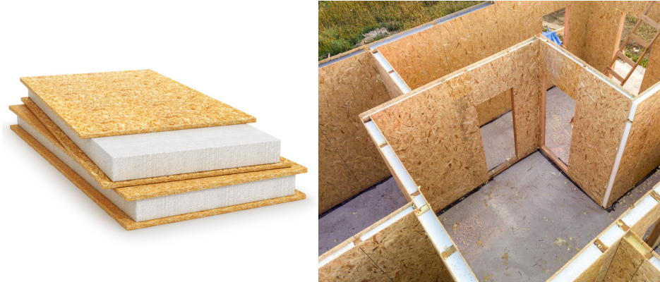
The SIPs depicted have two sides of sheathing attached to a foam core.

site, collectively forming an energy efficient building. SIPs can streamline the production process and therefore lower costs, compared to traditional stick-building. Currently, as lumber prices have skyrocketed, there is some research that SIPs are also proving more cost effective.