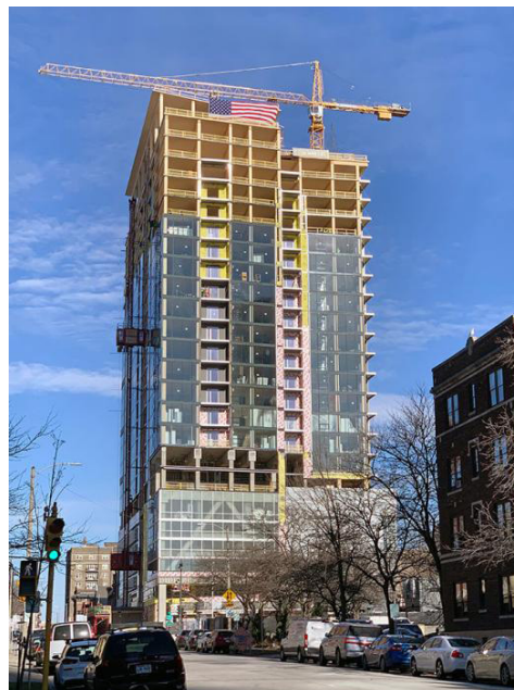
Ascent, a mixed-use, tall wood development containing 259 apartment units in Milwaukee, WI.

The benefits of mass timber and using lumber in tall buildings are many.